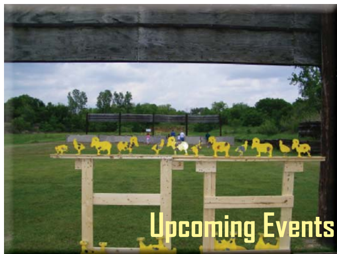
Kids helping set up targets during Youth Shoot

May 3 - Noon Club Skeet Shoot May 4 - 5:00 PM Sporting Clays League May 5 - 5:30 PM Beginner's Skeet Instruction May 6 - 6:00 PM Bullseye Pistol Match May 7 - 6:00 PM Thursday Skeet League May 7 - 7:30 PM GPGC Board of Directors Meeting May 9 - 10:00 AM Hunter Ed Instructors Appreciation May 10 - Mother's Day May 11 - 5:00 Sporting Clays League May 12 - 5:30 PM Beginner's Skeet Instruction May 13 - 6:00 PM Bullseye Pistol Match May 14 - 6:00 PM Thursday Skeet League May 16 - 1:00 PM Public Day May 17 - 10:30 AM Sporting Clays Match May 19 - 5:30 PM Beginner's Skeet Instruction May 20 - 6:00 PM Bullseye Pistol Match May 21 - 6:00 PM Thursday Skeet League May 22 - 7:00 PM NRA Instructors Rifle Workshop May 23 - 8:00 AM NRA Instructors Rifle Workshop May 23 - 9:00 AM .22 Pistol Met. Silhouette Match May 24 - 8:00 AM NRA Instructors Rifle Workshop May 25 - Memorial Day May 26 - 5:30 PM Last night of Beginner's Skeet