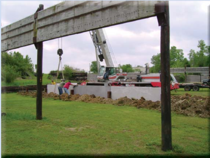
Ground baffle installation at the rifle range