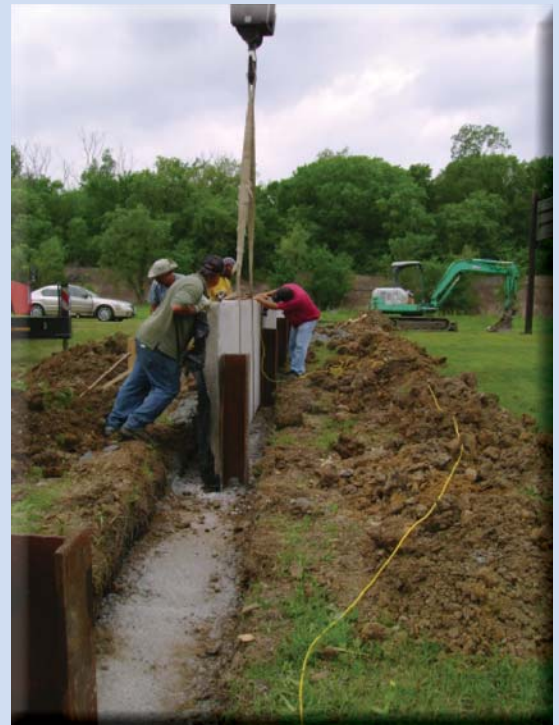
Ground level look at baffle system for rifle range