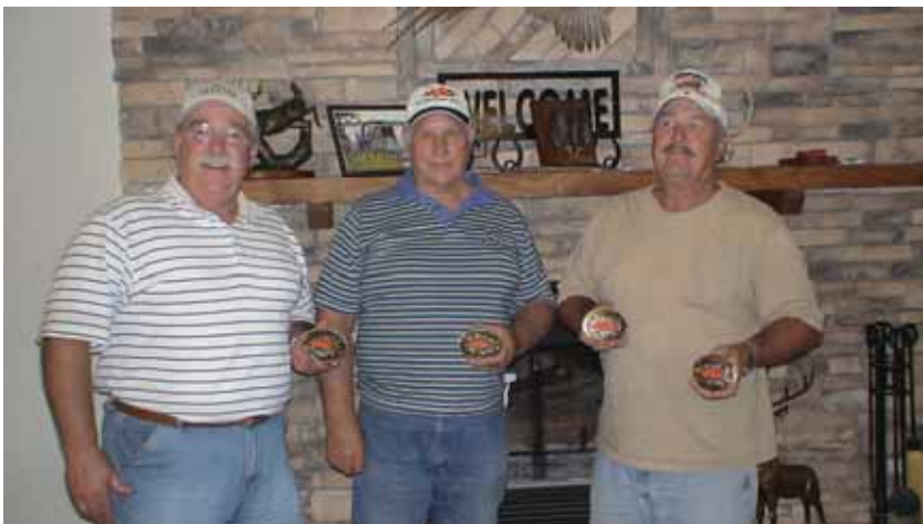
Leftovers, Third Place