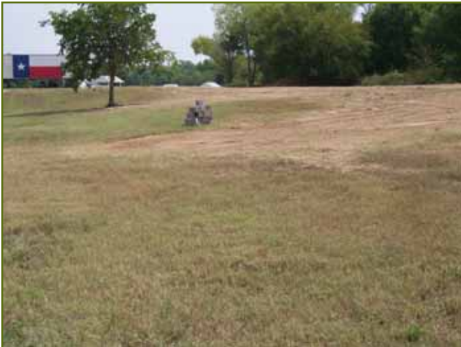
What is missing???