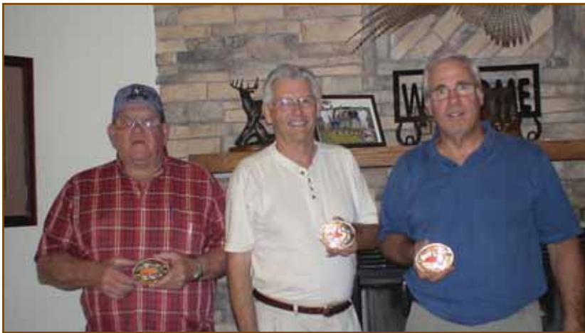
Go Figure, Second Place