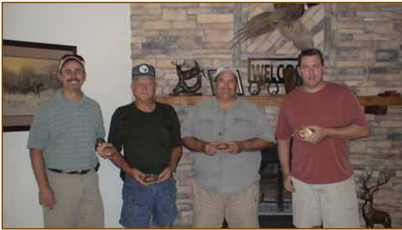
Duh Boys, First Place Champs