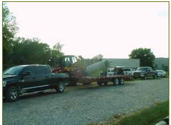
Shane Cole delivering more pipe