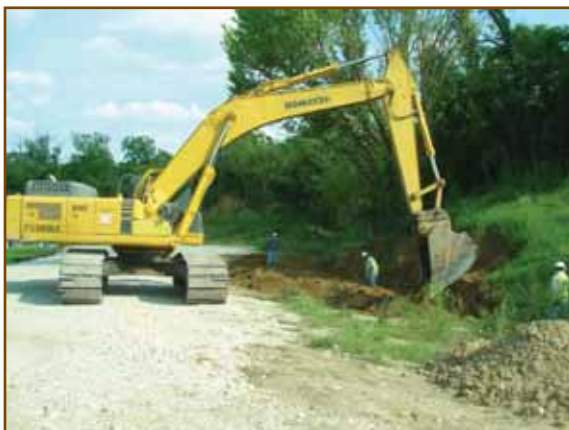
TRA installing sewer line

The contractor has started putting flow from the old line into the new line. They will be installing the tops to the vaults built on our property which will finish the work to the east of the shotgun ranges. The next thing that will be noticed will be the demolition of the metering station behind the Clubhouse. I know you will miss that smell! The entire area that has been disturbed will be graded and prepared for grassing. Several trees will be planted to replace some of the ones that were lost with the construction of the new line. Hopefully, all construction on our property will be completed in the next 2-3 months. Thanks for your patience.