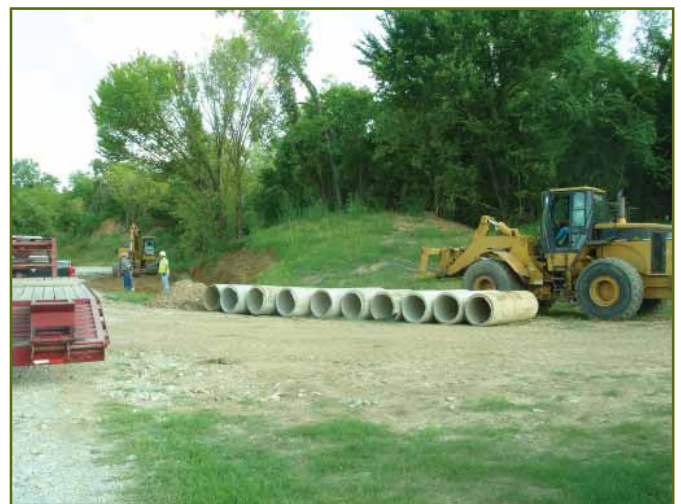
Storm sewer pipe to be installed