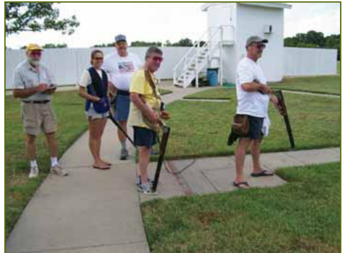
Just act natural. No DON'T pose...!