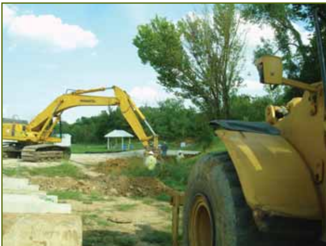
TRA under construction