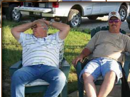
Waiting their turn