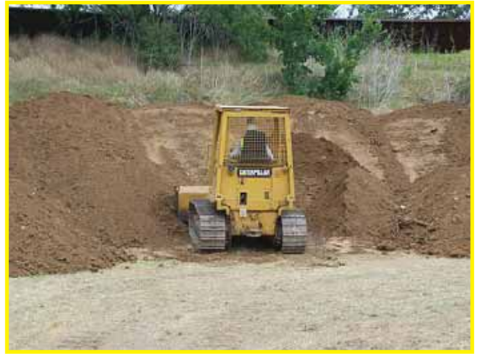
Rifle range refacing