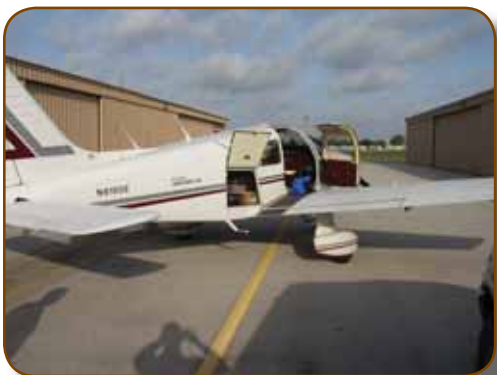
Our transportation, a.k.a. Kummer Airlines