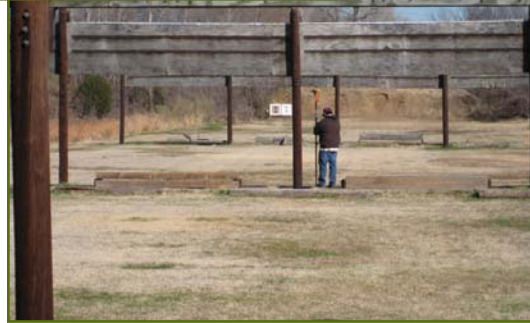
Eric Day with GPS equipment