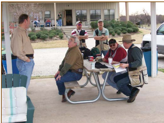
Trap group waiting for their shooting placement