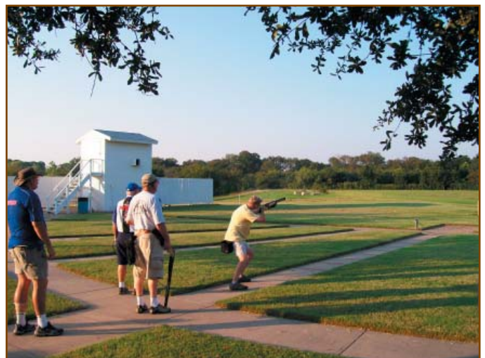
Taken at World Warm

The Muzzleloader Turkey Shoot is open to all current members in good standing and guests. The shoot will consist of five targets, 250-points offhand rifle aggregate. Rifle competitors may use any safe muzzleloading rifle of either traditional or modern design. Projectiles may be either round ball or conical. Sights for rifle will be any metallic sights; no opticals are allowed. All rifle matches are to be shot offhand, hunter-style. Distances will be 25 and 50 yards for rifles. All competitors will score their own target and complete their score sheets. The scores will be checked by the match committee. Each match will have a first, second, and third place winner that will be awarded with appropriate ribbon. The aggregate score from each match will determine the overall winner of the muzzleloader turkey shoot.