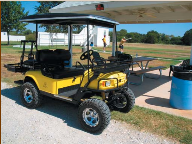
The ultimate sporting clays vehicle