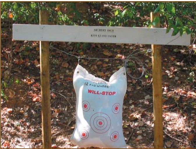
12 and under archery target