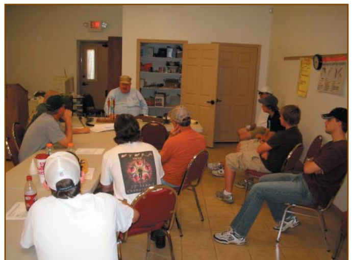
Hunter Ed Class