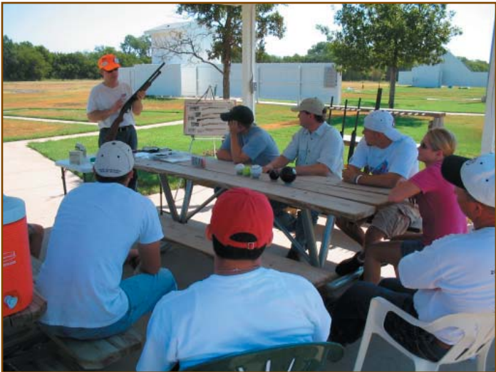
Hunter Ed Class Saturday