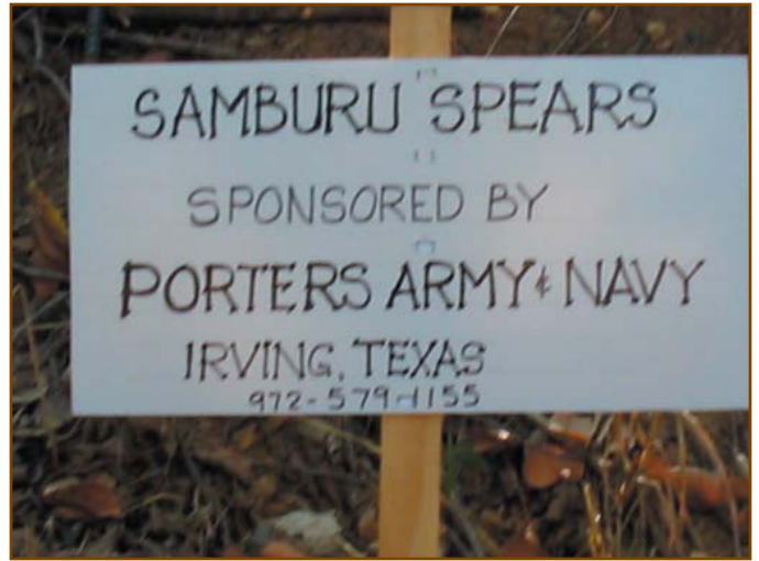
Porters Army-Navy helping sponsor new range