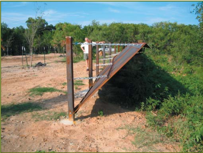
Kerry Williams inspecting the new steel ricochet catcher behind the rifle range