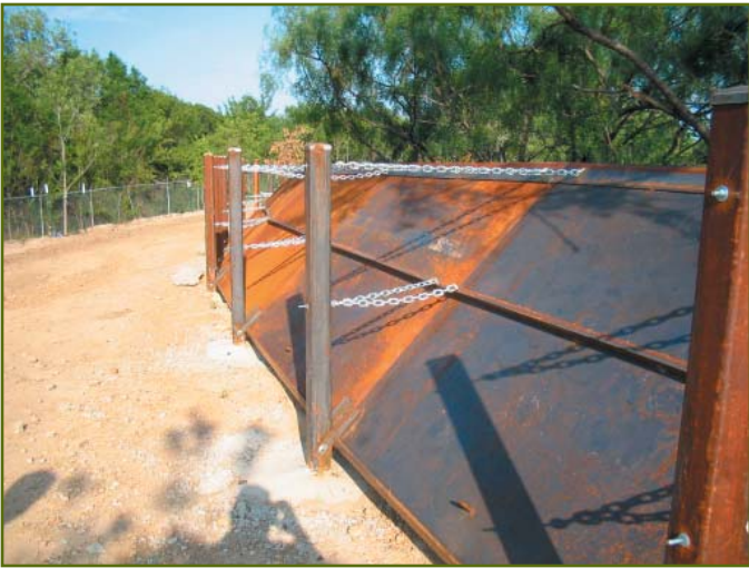
Ricochet catcher 6' high x 220 ft. long