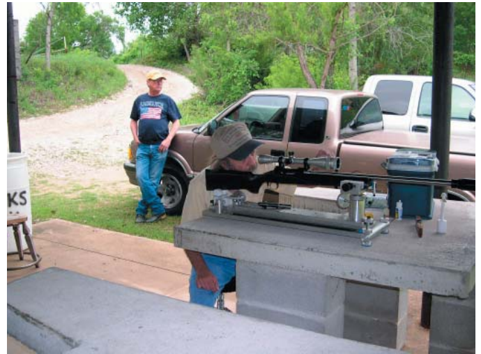
May ARA Shoot