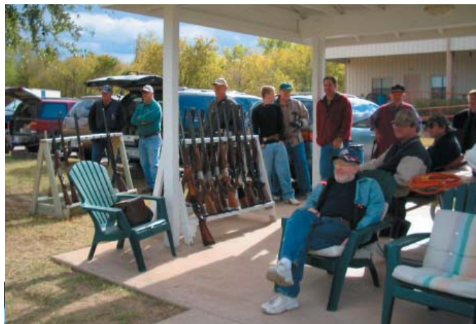
Big turnout for the Turkey Shoot. The gun rack is full.