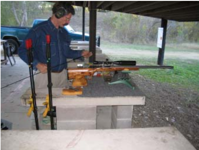
Long range equipment