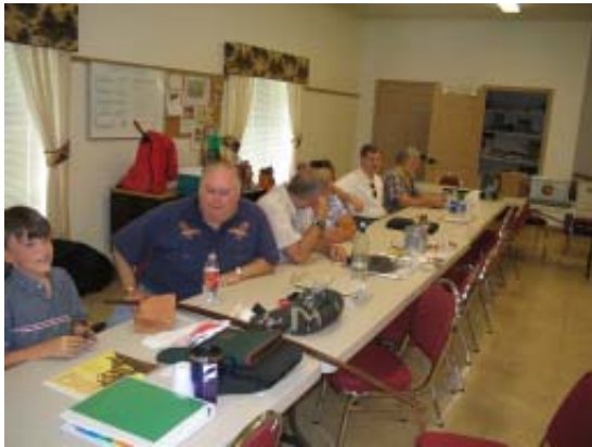
Archery Instructor Class in July